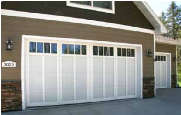
SR-82 in white with stockbridge windows