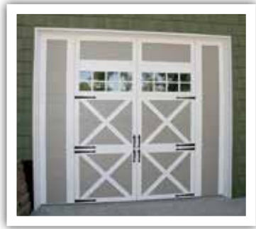
Custom Creation: Shown in Sandstone with Stockton windows