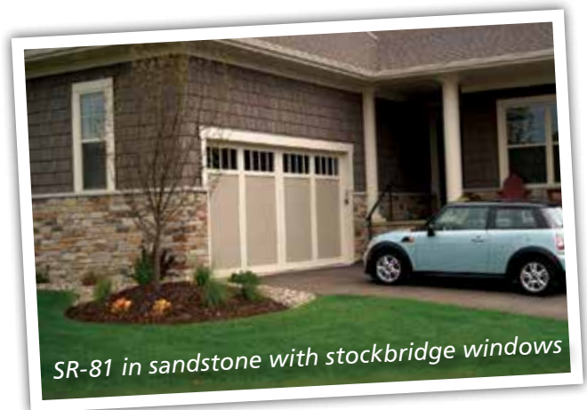
SR-81 in sandstone with stockbridge windows

With six distinctive styles, three classic colors and your choice of windows, you'll be able to create the perfect look to complement your home's architectural style and make it uniquely yours.