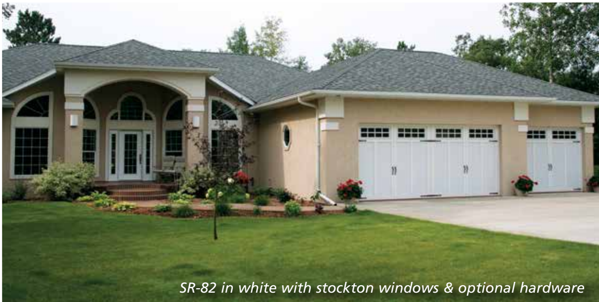
SR-82 in white with stockton windows & optional hardware