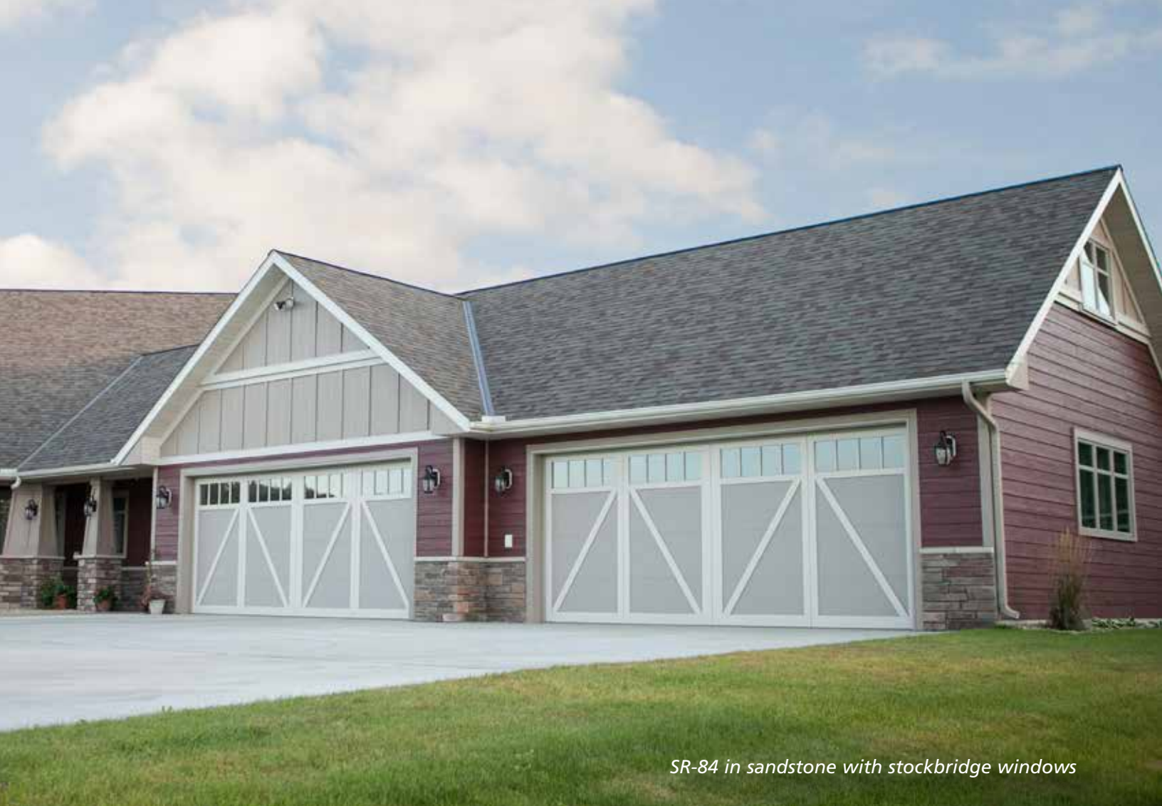
SR-84 in sandstone with stockbridge windows

With classic beauty, durability and thermal efficiency, your home will be