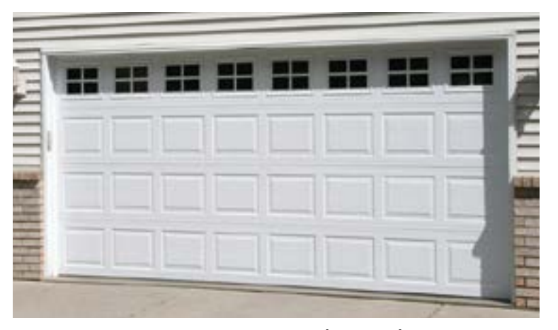
R-1000 Raised Panel