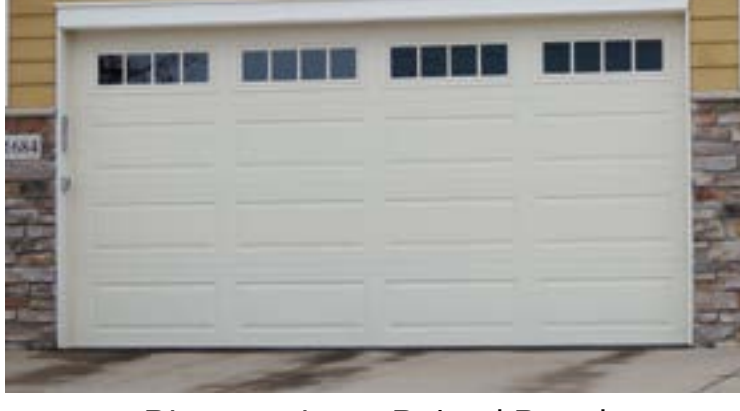
RL-1000 Long Raised Panel