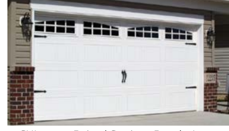
CHL-1000 Raised Carriage Panel - Long