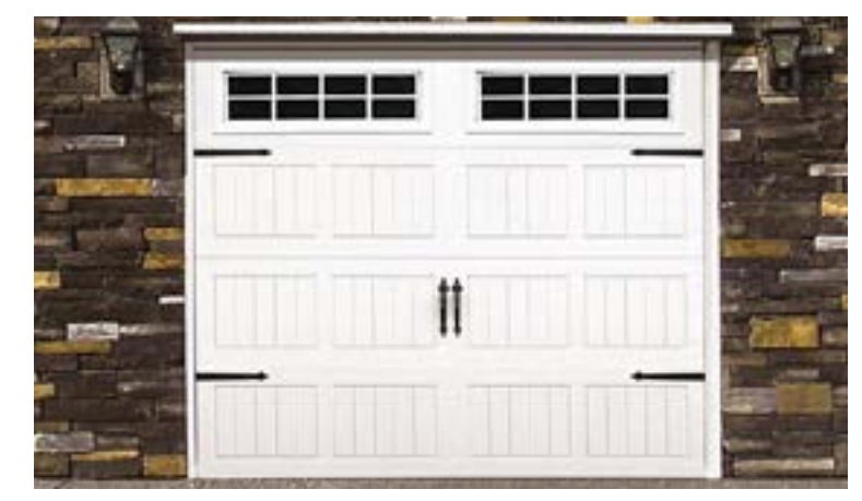
CH-1000 Raised Carriage Panel - Short