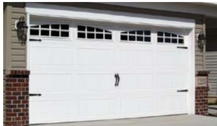
CHL-2000 Raised Carriage Panel - Long