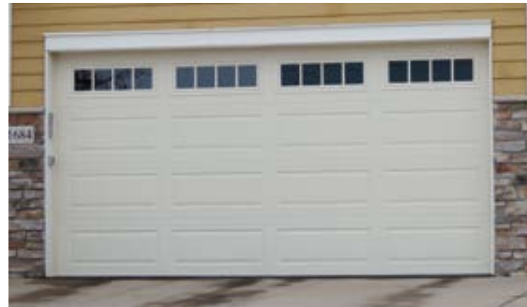
RL-2000 Long Raised Panel