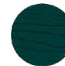
Green - UPGRADE