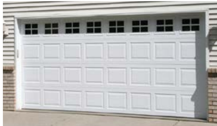
R-2000 Raised Panel