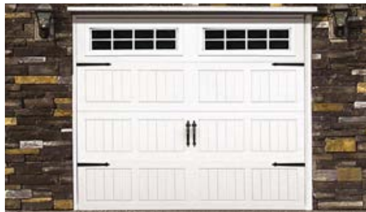
CH-2000 Raised Carriage Panel - Short