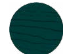
Green - UPGRADE