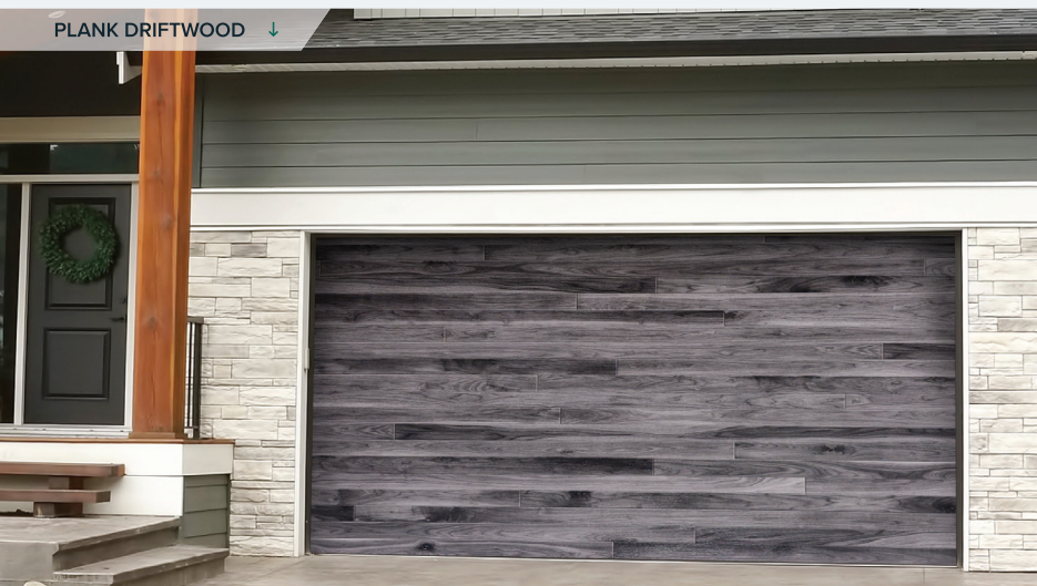
PLANK DRIFTWOOD ↓

View all the specs for this door online at doorLinkmfg.com