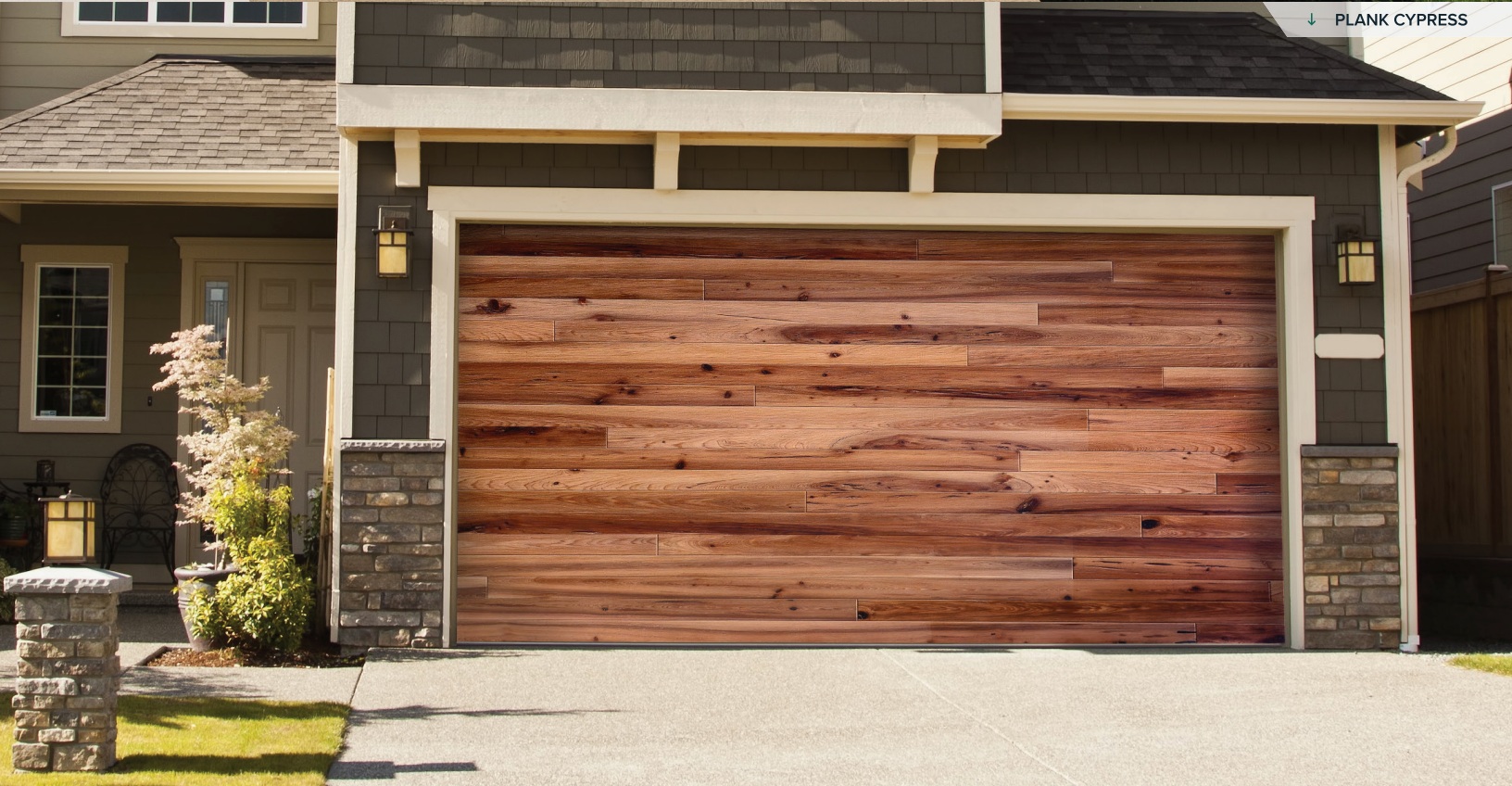
↓ PLANK CYPRESS